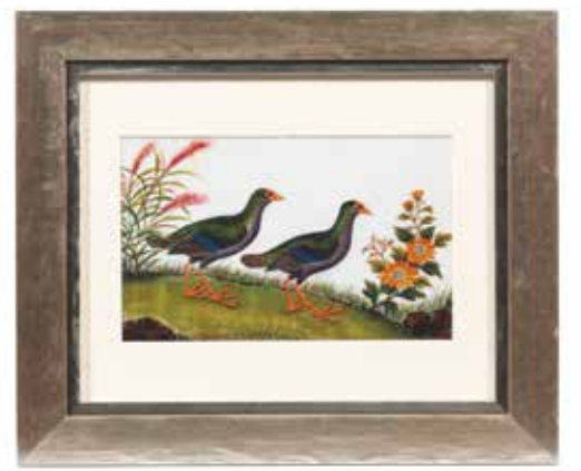
(three of twelve)