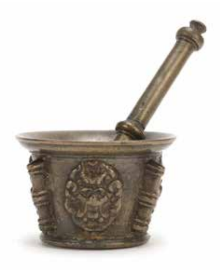
270 AN ITALIAN BRONZE MORTAR AND PESTLE