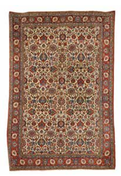
233 A KASHAN RUG