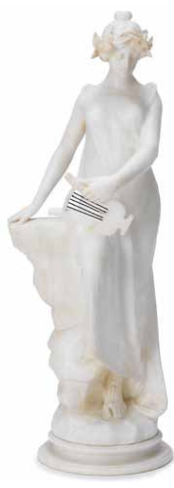
142 AN EARLY 20TH CENTURY CARVED ITALIAN TP CARVED ALABASTER FIGURE OF A MUSE

wearing a lacy bonnet, holding one hand to her eye, wearing a lacy bothlet, holding one hand to her eye, the other holding a broken dish and a spoon, raised on a separate turned marble circular socle, 47cm high overall (2) £800 - 1,000 €920 - 1,100