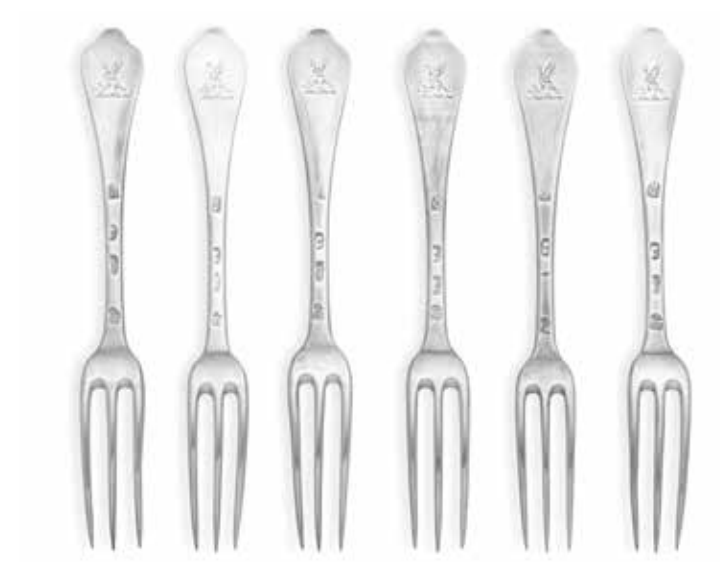
42 A SET OF SIX QUEEN ANNE SILVER TABLE FORKS

by Isaac Davenport, London 1705 Engraved with a later crest, length 19.5cm, weight 11.5oz.