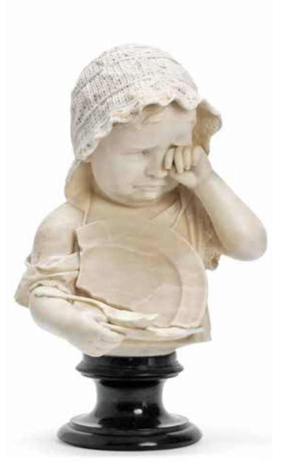
141 A LATE 19TH CENTURY ITALIAN CARVED TP ALABASTER BUST OF A TEARFUL CHILD

wearing a lacy bonnet, holding one hand to her eye, wearing a lacy bothlet, holding one hand to her eye, the other holding a broken dish and a spoon, raised on a separate turned marble circular socle, 47cm high overall (2) £800 - 1,000 €920 - 1,100