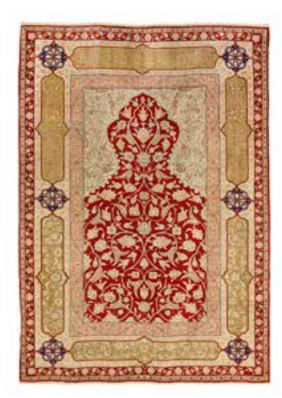
234 A HEREKE SILK RUG

£1,500 - 2,000 €1,700 - 2,300 Please note that this lot is subject to the US embargo on the import of carpets of Iranian origin as of the 6.8.2018