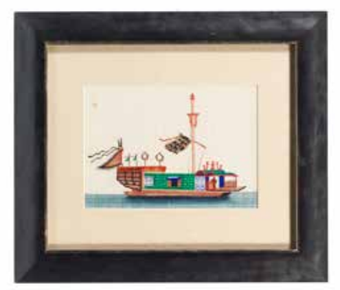
(four of twelve)