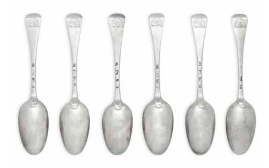
43 A SET OF SIX GEORGE I SILVER TABLE SPOONS

by Charles Jackson, London 1716 With rat-tail bowls, crested, length 20.2cm, weight 14oz. (6)